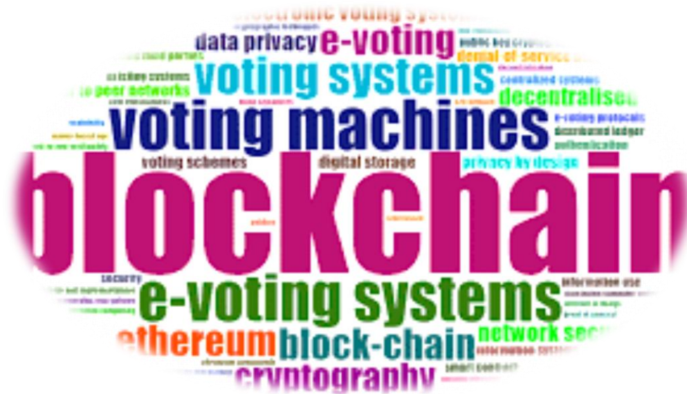
Figure 2: A word cloud created using Rstudio keywords.

Subject Description: By creating a database of words and an illustration that shows the relationships and internal connections between the concepts of a permissioned blockchain voting system and how they are evaluated and used, we can get useful feedback on our papers. According to Table 1, the terms "Permissioned blockchain voting system concept" and "Permissioned blockchain voting system architecture" occurred in the titles of the publications the most frequently. In the context of our research, we conducted initially papers that produced some terms referring to typical concepts ("Permissioned blockchain voting system concept"). Therefore, after retrieving the data set from the IEEE Xplore, Scopus, and Web of Science databases, we had to perform some preliminary processing tasks, such as ignoring numbers and disregarding case sensitivity, The number of phrases, phrase occurrence metrics for the articles via bibliophily within RStudio, and cloud selection word. The created terms are depicted in Figure